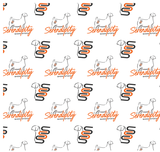
SEAMLESS BRAND PATTERN